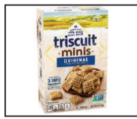
8 OZ MINI TRISCUIT 99¢