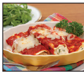
CHEESE MANICOTTI $1.99 LB