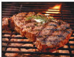
TOP SIRLOIN FILETS $6.49 LB WHILE SUPPLIES LAST

All Our Meat is Cut Fresh Daily In-house, Unlike Some of Our Competitors!