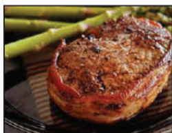
BACON WRAPPED SIRLOIN FILETS $6.49 LB WHILE SUPPLIES LAST