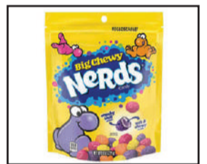
6/8 OZ CHEWY NERDS $6.00