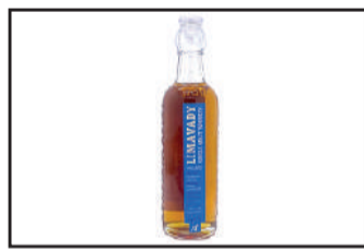
LIMAVADY SINGLE MALT WHISKEY 700 ML $43.29