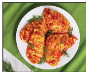
20 LB ITALIAN CHICKEN PATTIES $20.00