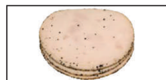
SLICED PEPPERED TURKEY $4.99 LB