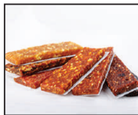
12/1.3 OZ SUPER FOOD DATE BARS $2.99