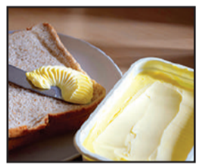
13 OZ BUTTER SPREAD $2.49