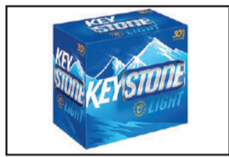
KEYSTONE LIGHT 30 PACK $15.99 THIS WEEK ONLY