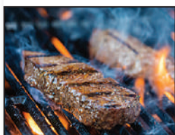
TOP SIRLOIN STEAK $6.49 LB