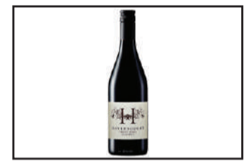
HAVENSCOURT PINOT NOIR $6.00