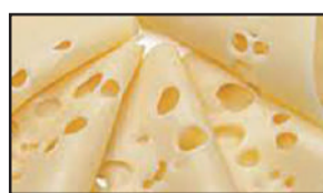
SLICED LACY SWISS $3.99 LB