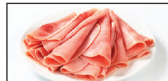
SLICED SMOKED HAM $2.99 LB