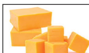
AMISH CHEESE $3.99 LB