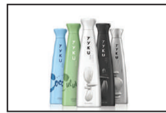
TYKU SAKE 330 ML $9.59