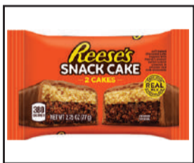
12/2.75 OZ REESE'S CAKES $5.95