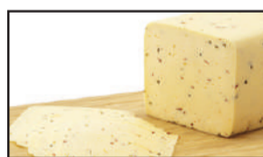
SLICED JALAPENO HAVARTI $7.79 LB

More Budget Friendly Priced, Than The Competition!