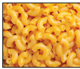
96 OZ FROZEN MAC AND CHEESE TRAYS $9.99