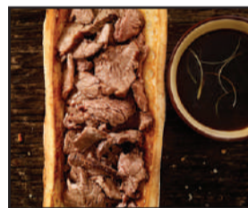
10 LB PHILLY CHEESE STEAK MEAT $24.00