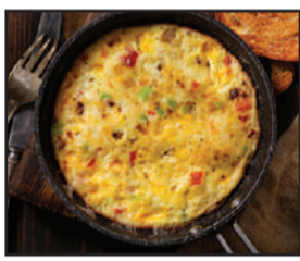
16 OZ SAUSAGE SKILLET KITS $2.99