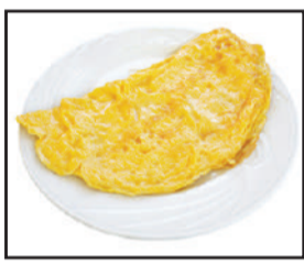
2.5 OZ CHEESE AND EGG OMELETS 79¢