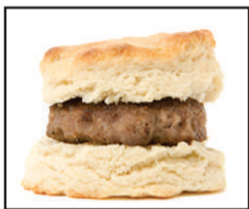
8/3.3 OZ HONEY BISCUIT AND SAUSAGE BITES $6.00