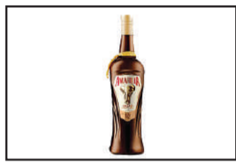
AMARULA 1 L $28.99